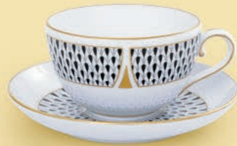
06 Teacup w. saucer 02703100VHNKN, 02703200VHNKN