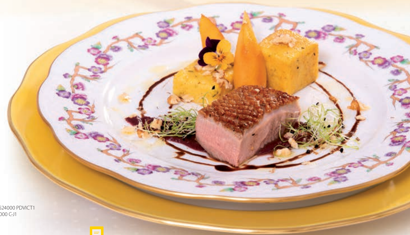
Diner plate 20524000 PDVICT1 Charger 20158000 CJ1

Apicius Restaurant and Café 8440 Herend, Kossuth u. 137. Telephone: +36 (88) 523 235