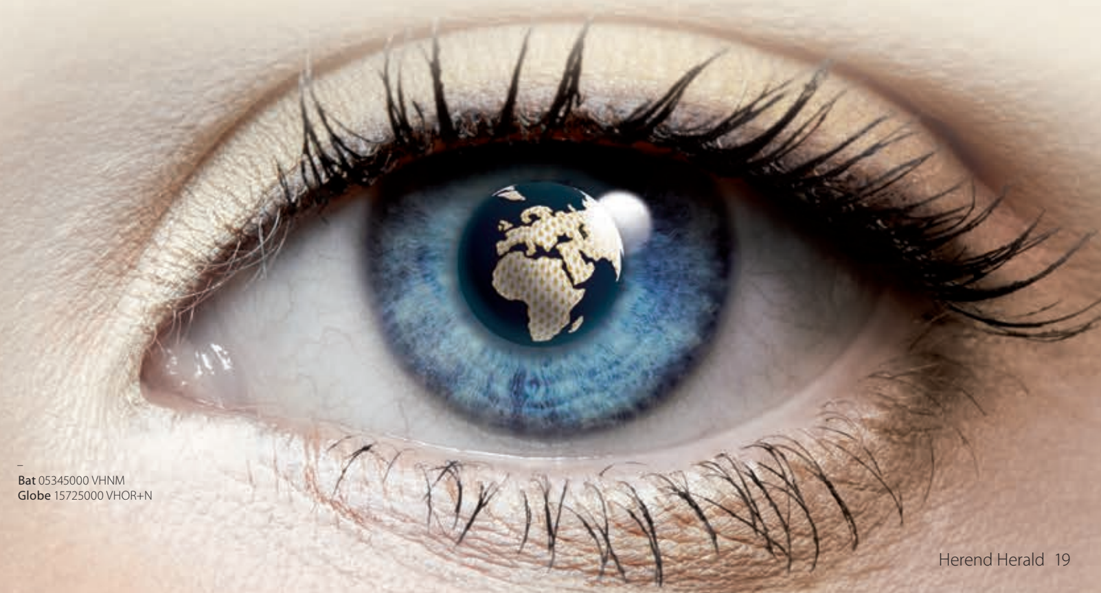
Bat 05345000 VHNM Globe 15725000 VHOR+N

The invention of radio, the beginning of aviation and the number of wars, brought into existence ever more sophisticated navigation systems, though the real breakthrough came only in the era of satellites. Since the 1950s, space researchers had been experimenting with the development of a navigation satellite system, originally intended for military and exploration purposes and, in 1973, the US Department of Defence came up with DNSS, now known as GPS. By the 1990s, the Global Positioning System had infiltrated everyday traffic and, today, it can also help us keep our children safe through a tracking keychain.