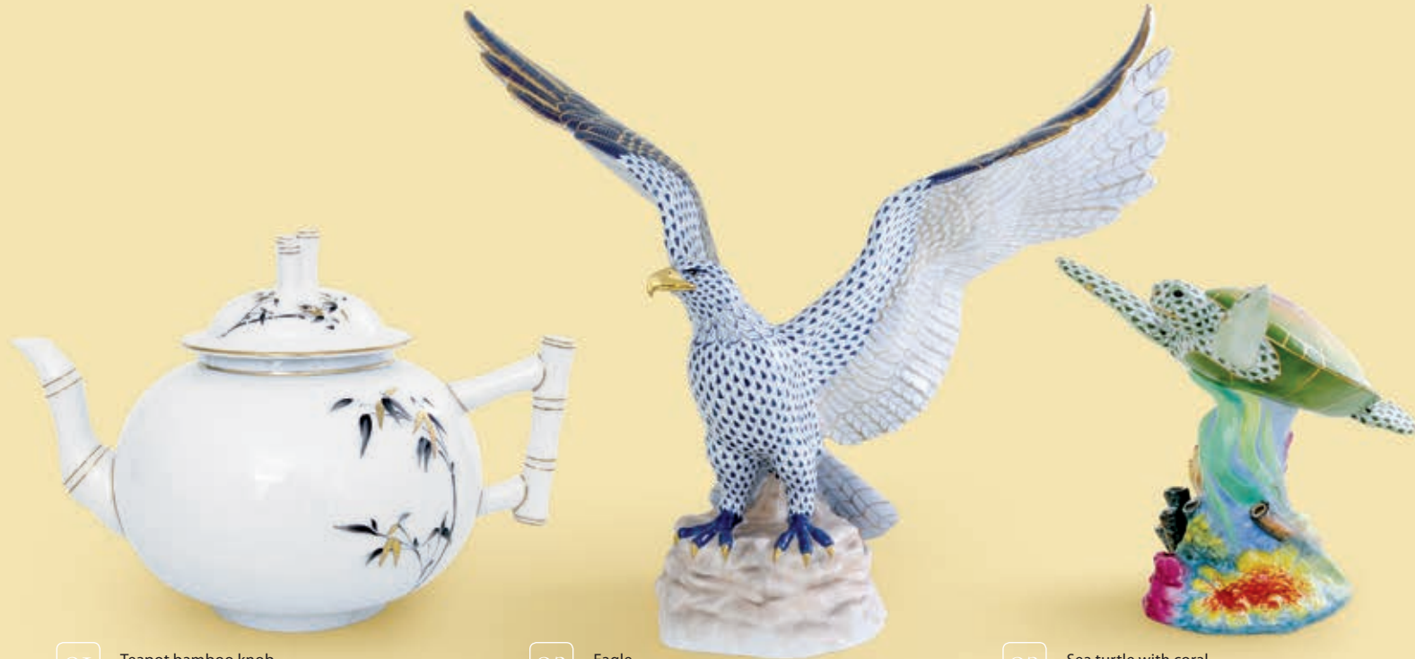
01 Teapot bamboo knob 03402091SAJU

A colour, a motif, a shape - so many things to associate with the beloved person. Express your attention with a surprise that can be a worthy symbol of your relationship.