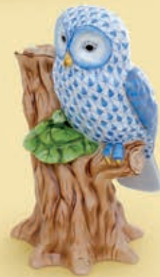
05 Owl on branch 05831000VHBM+C