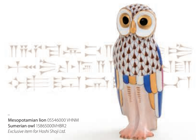
Mesopotamian lion 05546000 VHNM Sumerian owl 15865000VHBR2 Exclusive item for Hoshi Shoji Ltd.

We spend the night on a boat, as we must take to the water to reach the city-state of Uruk on the Euphrates. Uruk was founded by the Sumerians and the city is renowned for many innovations, including the science of writing, which is taught in the local schools. Instead of writing in pictures and symbols, they use cuneiform - although they dispute with the Egyptians over who invented it first. For Uruk writing, they use soft clay tablets, impressing the text into them with reed styli, and then dry or bake the tablets in the sun. It seems very simple, but it took a long time to write down an epic about Gilgamesh, the King of Uruk (one of humankind's oldest written sources)... The dozens of bazaars of the rich merchant city tempt us to buy souvenirs, but even if we cannot find anything that matches our taste, one thing is certain: we will return home with the gift of civilisation.