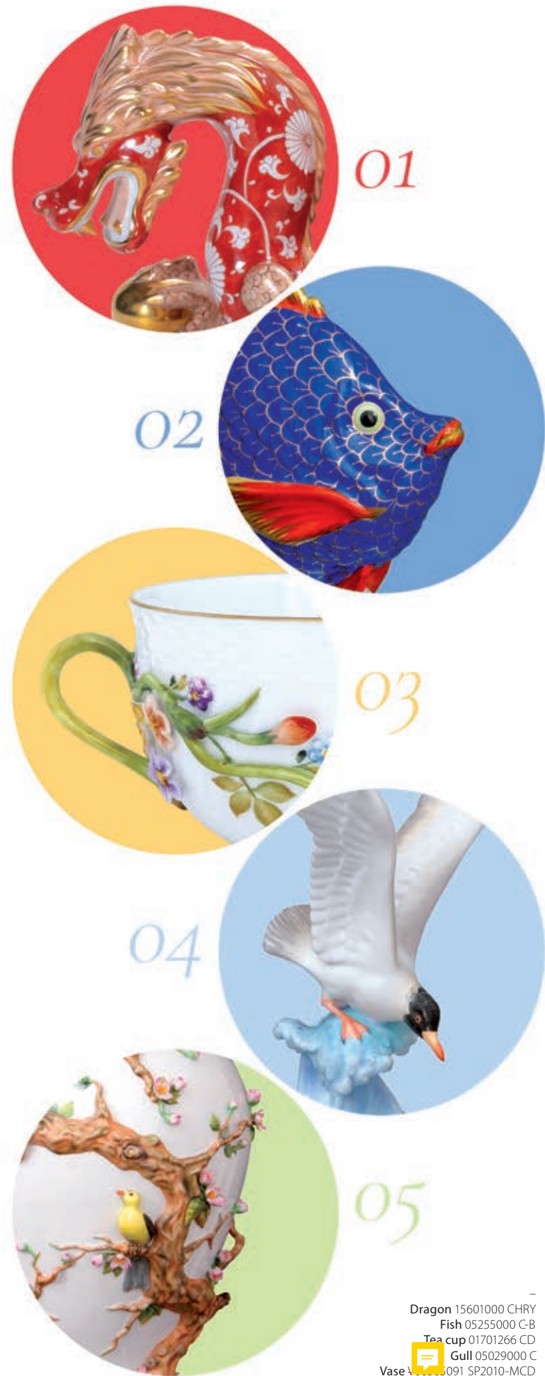
Dragon 15601000 CHRY Fish 05255000 G-B Tea cup 01701266 CD Gull 05029000 C Vase 091 SP2010-MCD

Did you know? The raw material of Herend porcelain and its production is in itself a special process as, in addition to the secret formula of kaolin, feldspar and quartz, five elements are needed, namely: fire, water, air, earth and wood.