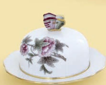
04 Butter dish 00393017VICTF2